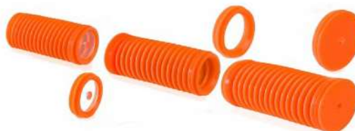
D1 - Disco D2 - Junta